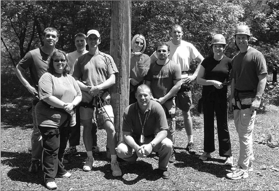
Class of 2008