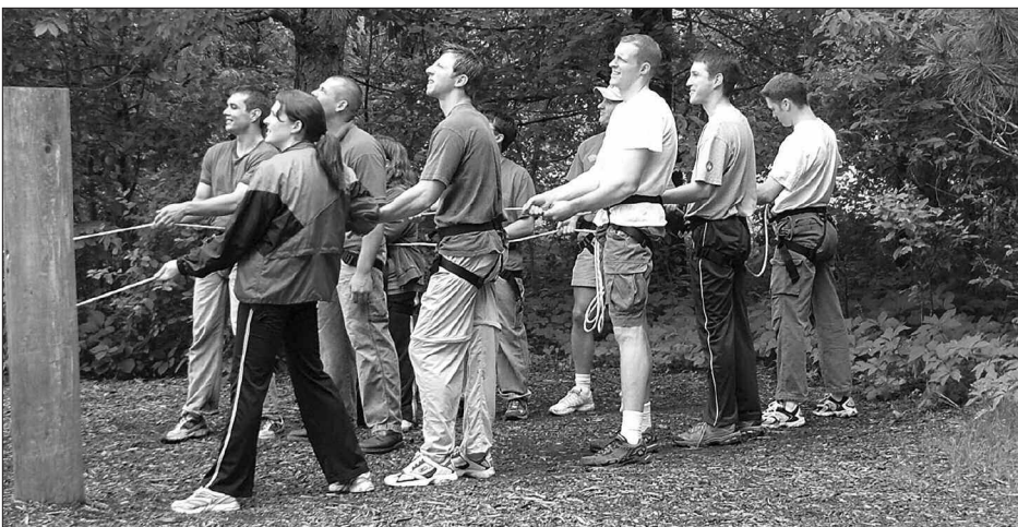
Class of 2008