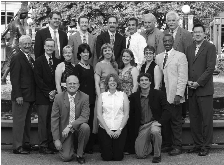
2005 EM Faculty

University of Illinois University of Pittsburgh University of Virginia EM/IM Henry Ford Hospital - Detroit Harvard Affiliated EM/Peds University of Maryland Indiana University FP - St. Paul-Ramsey Medical Center FP - St. Paul-Ramsey Medical Center Regions Hospital Regions Hospital IM - University of Minnesota University of Maryland Brooke Army Medical Center Regions Hospital Regions Hospital IM - Abbott Northwestern Hosp. Regions Hospital St. Vincent Medical Center - Toledo Ortho - Creighton University Valley Medical Center, UCSF-Fresno Christ Hospital - Chicago FP - Loma Linda University Regions Hospital Hennepin County Medical Center University of Michigan University of New Mexico University of Michigan Regions Hospital EM/IM Henry Ford Hospital - Detroit University of Cincinnati