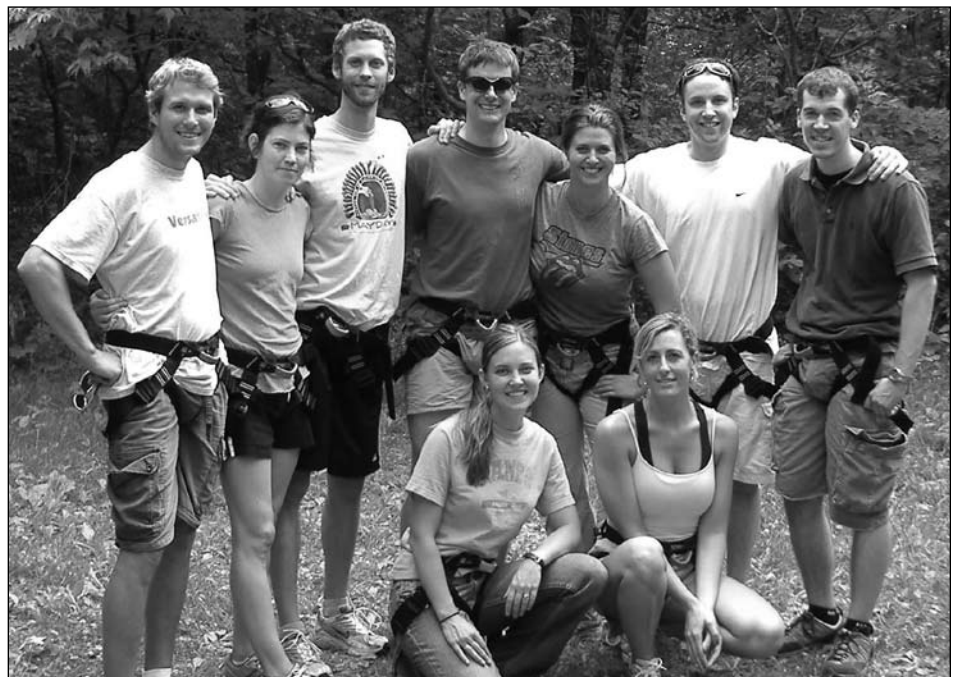
Class of 2009