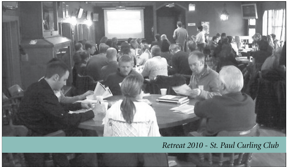
Retreat 2010 - St. Paul Curling Club

We are also continuing the change made last year to the intern schedule where EMS