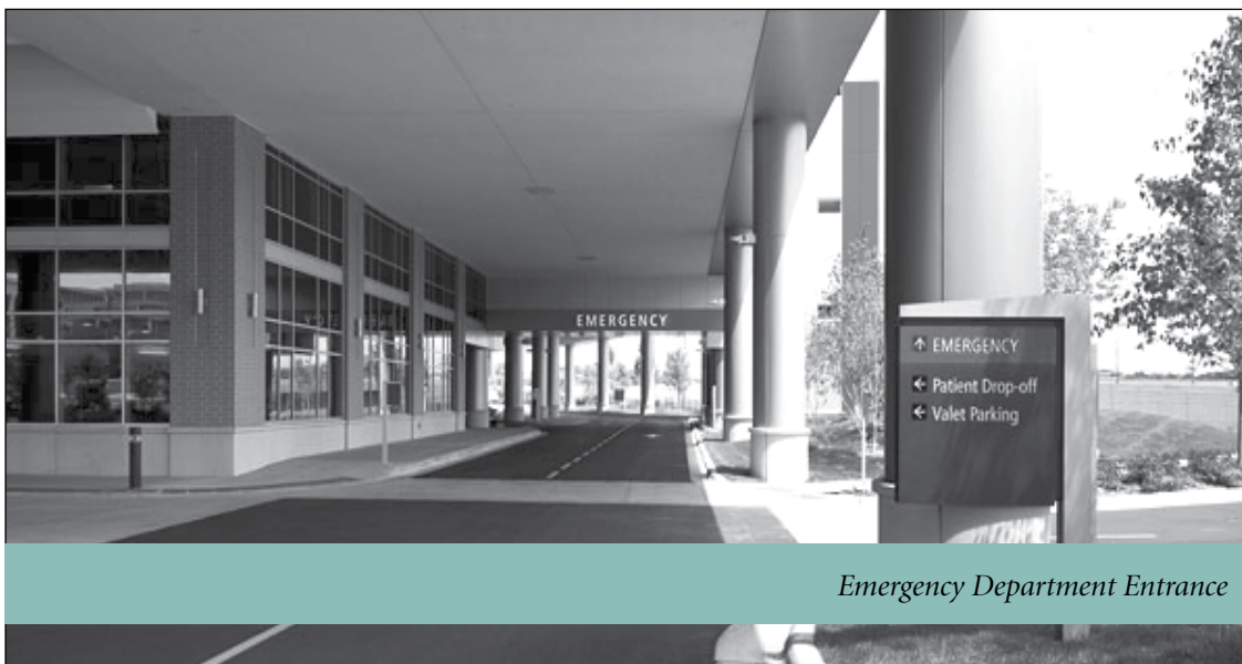
Emergency Department Entrance