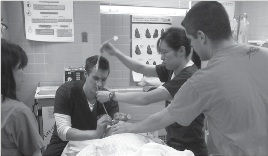
Combined sim day with HCMC May 20, 2010

Regions Emergency Medicine Department continues to have a strong interest and commitment to medical student education. Rotations hosted at Regions include our core, required EM clerkship through the University of Minnesota Medical School, our advanced EM clerkship, our toxicology course, and a new elective bedside ultrasound experience.